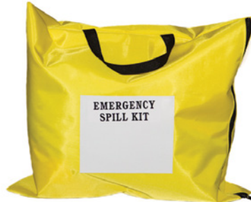
Standard Flat Bag