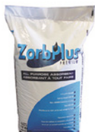
Granular & Remedial Agents