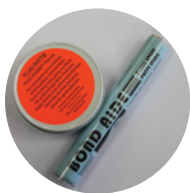
Bonding Agents (Epoxy, Plug & Dyke)