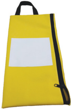
Small Flat Bag