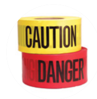
Scene Control (Caution Tape, Pylons)